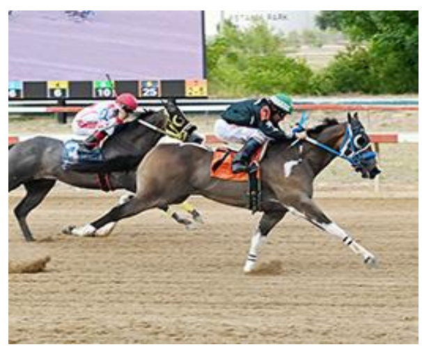
WL Van Halen - 2022 Colors of the Alamo

Trials August 3, 2023, and Finals August 19, 2023